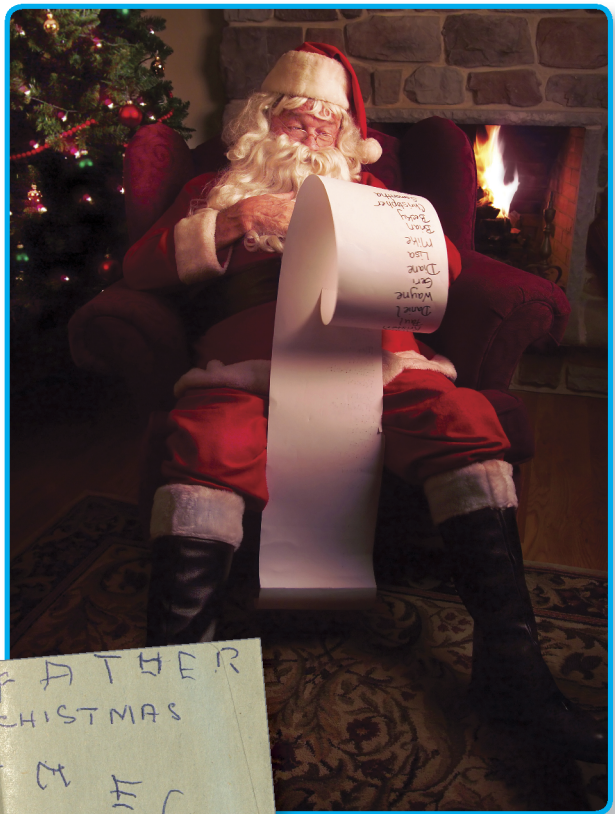
Santa replies to all letters he receives.