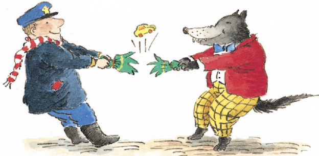
The Jolly Postman and B.B. Wolf pull a cracker.

Christmas is the busiest time of year for posties. Every year, thousands of extra workers help to deliver millions of parcels and Christmas cards.