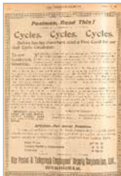
©Royal Mail Group Ltd, 2015, courtesy of The Postal Museum, The Postman's Gazette, 1889

Bicycles invented and used to deliver mail