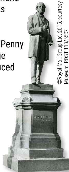
©Royal Mail Group Ltd, 2015, courtesy of The Postal Museum, POST 118/5507